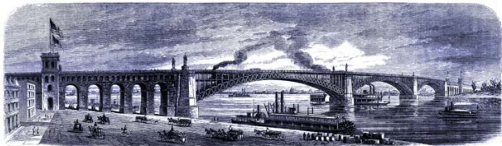
Mississippi River, Louisiana, 1800s

There is an opportunity to explore the story, themes and activities in the context of the five Goals of Sacred Heart education, Faith, Intellect, Character, Community and Social Awareness, and any of the above mentioned methods can be adopted.