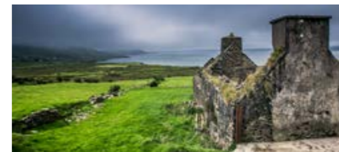
Deserted famine cottage, West of Ireland

Although the Famine also affected other European countries, Ireland was affected the most because of the large number of people totally dependent on the potato crop. The population of the country was reduced by almost twenty five percent.