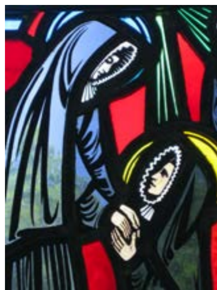
Sophie and Philippine Stained Glass Window

Sophie Barat to Philippine Duchesne, Paris, 5 November, 1818