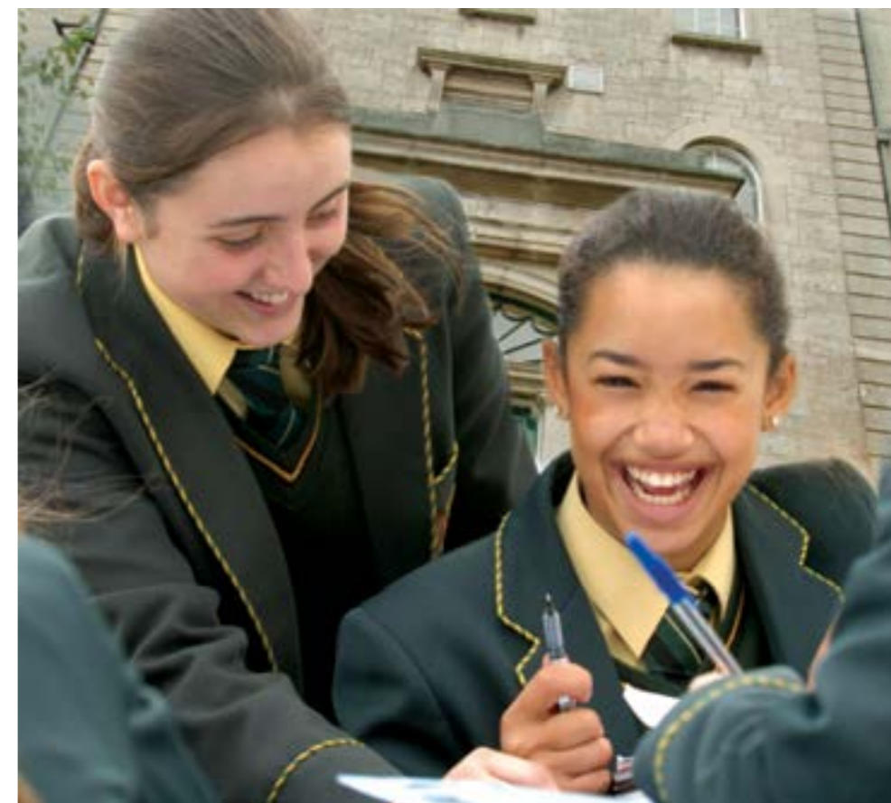
St. Catherine's College, Armagh, Ireland

How do you think Philippine's and Sophie's relationship and friendship link to the five Goals of Sacred Heart education: Faith, Character, Intellect, Community and Social Awareness?