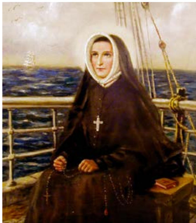
Philippine aboard the 'Rebecca'

They were ten weeks at sea. They endured violent storms, seasickness, spoiled food, cramped conditions, and even pirates.