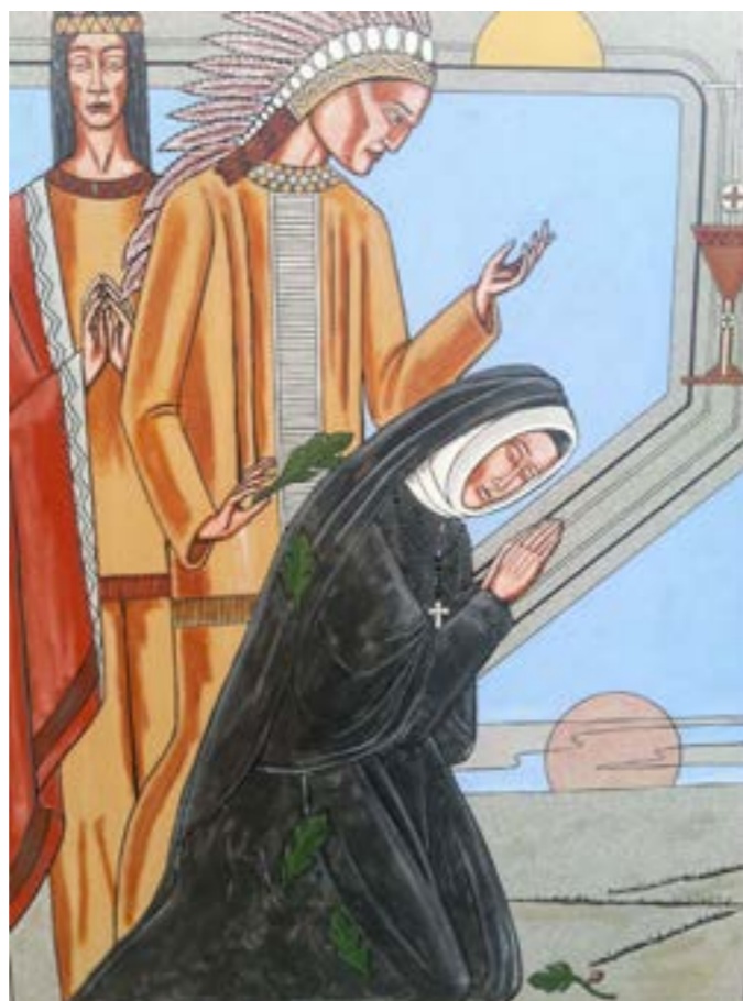
Philippine and the Potawatomi

Sophie Barat to Philippine Duchesne Paris, 30 November, 1831