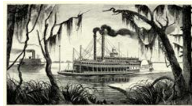
Steamboat Mississippi River, 1800s

Nevertheless, she managed to build a close relationship with them that is still recognised today. She lived through illness and disease and never ceased to pray.