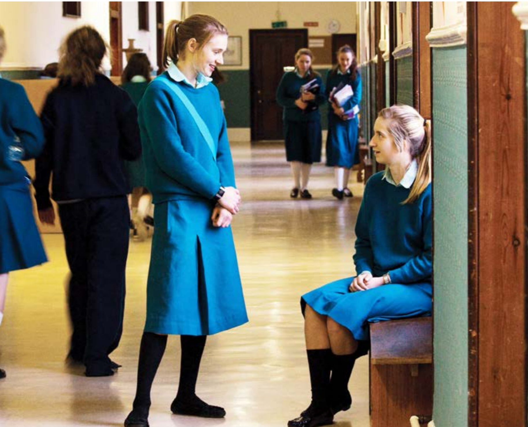
Mount Anville School, Dublin, Ireland